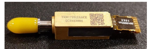
Quasi-coherent transceiver sub-assembly.

With Bifrost's patented analogue (no-DSP), near-zero latency solution that further includes chromatic dispersion compensation, Bifrost provides up to 40 km reach at 25 Gb/s and up to 20 km reach at 50 Gb/s in the C-band.